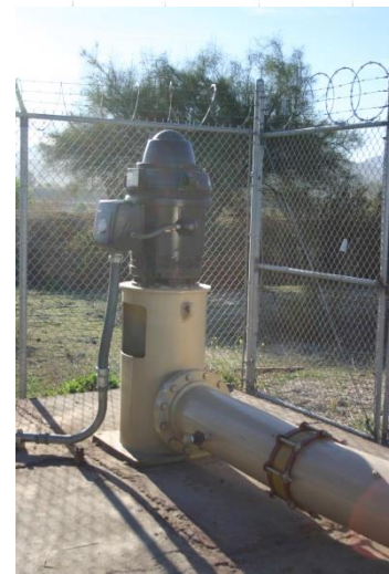
Photo's clockwise from top left - Flume No. 2 Pump house 1977, Flume No. 2 Pump and MP 1977, Flume No.2 in fence and cage 2009, Flume No.2 pump 2009.