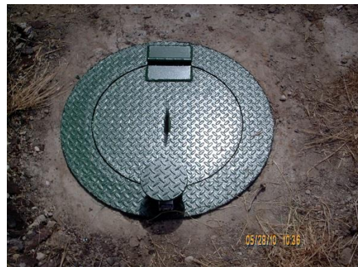
Photo's clockwise from top left - Johnson No. 1 Pump house 1977, Johnson No. 1 Pump and MP 1977, Johnson No.1 lid open May 2010, Johnson No.1 close-up May 2010.