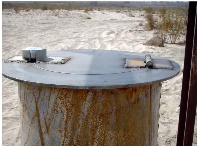
Photo's clockwise from top left - Flume No. 5 measuring pipe 1977, Flume No. 5 Measuring pipe 2007, Flume No.5 new measuring box, 2010, New lid for data logger access.