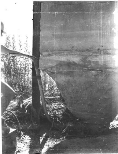
close up of new Flume #5 measuring pipe' about 1977

After October 16, 2009, Reference Point Elevation: 913.448 / 914.622